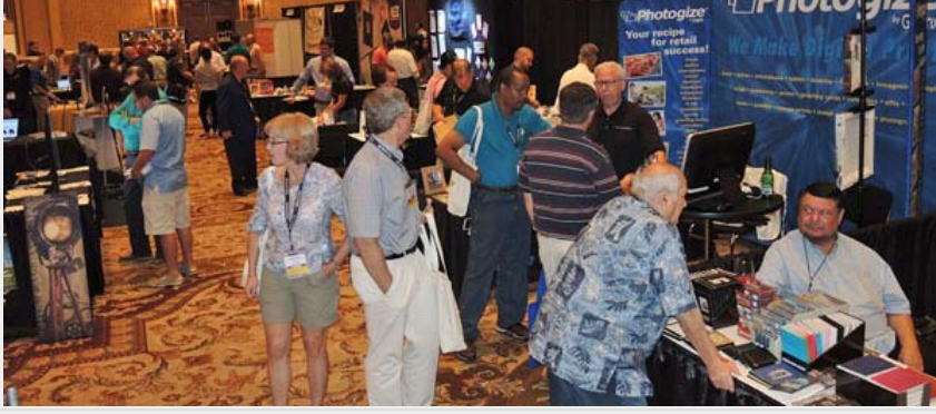
— The trade show – lots to see (and buy) and ideas to purloin!