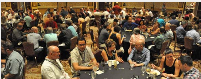
— Gathering together for meals is a recurring highlight ('moveable feast?') at IPIC.

We all know 'it's not what it used to be' (or at least everyone keeps telling me that!). We are now looking at new paper surfaces to offer our customers something different for their traditional printing and enlarging..